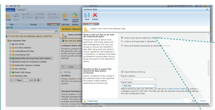
Archive Groups, Sites, and OneDrive for Business content with business-driver, policies to improve data quality or satisfy regulatory retention requirements.